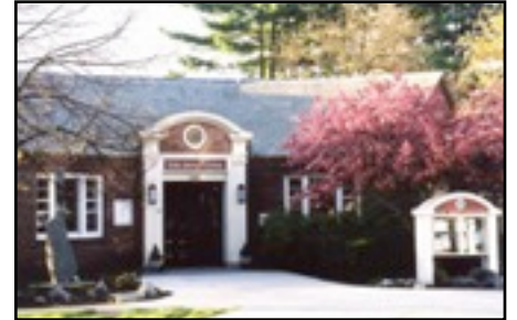
Saratoga Arts Center

Founded in 1977, the Decentralization Program (DEC), known locally at Saratoga Arts as Community Arts Grants, was developed to ensure New York State’s cultural funding reached every part of the state. In 1993,